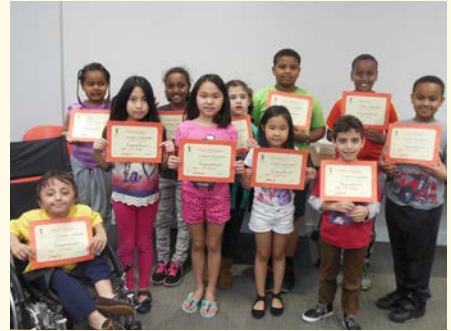
Read Aloud in Action at Arlington Mill. Cooking class graduation at The Springs.